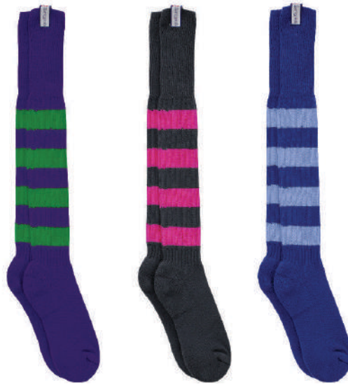
Aubergine & Greenery